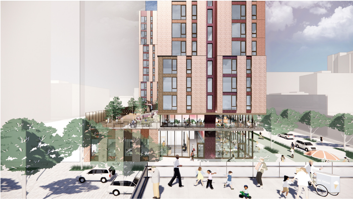
3. View from Pavilion Looking West