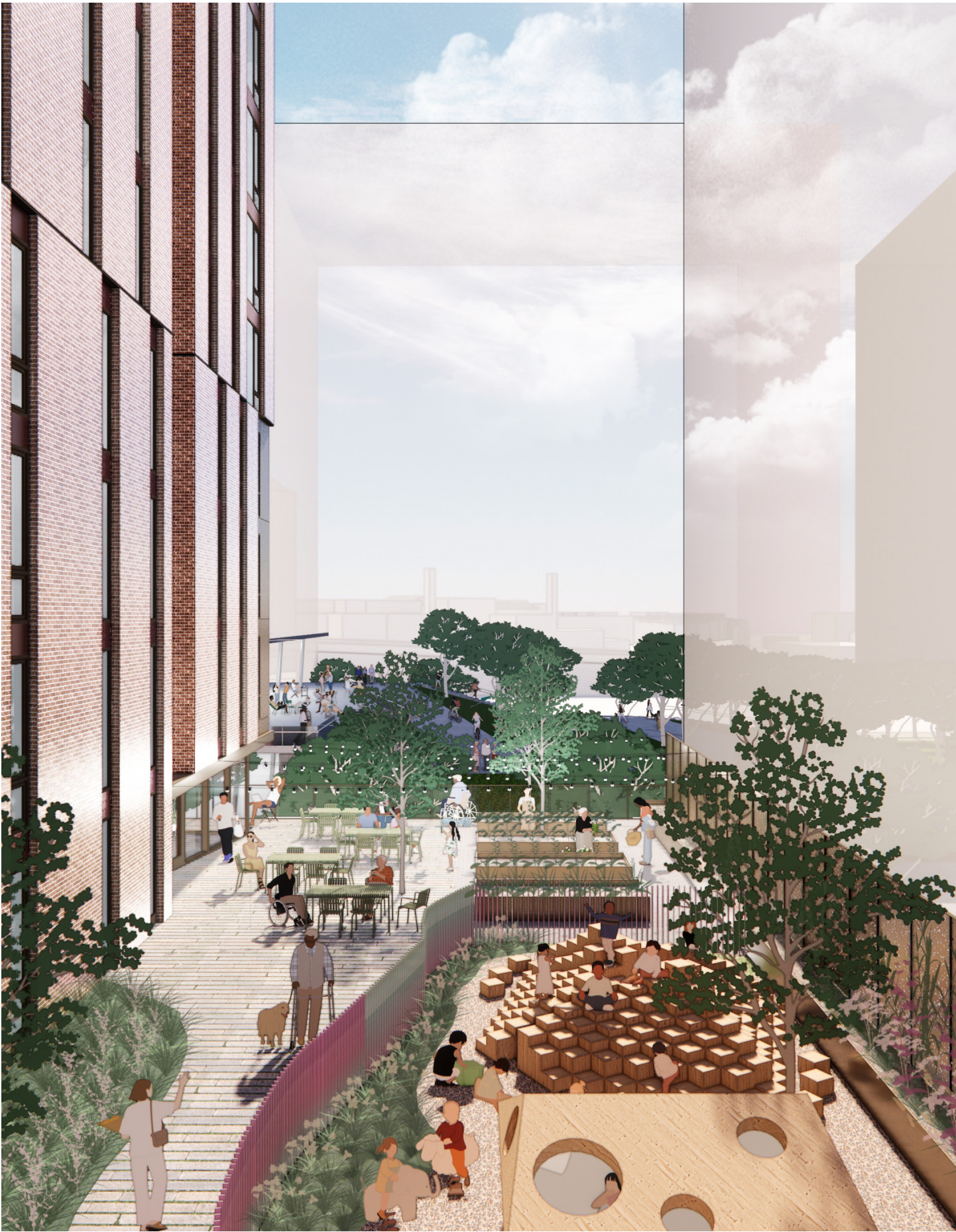
4. View from Roof Deck Looking East