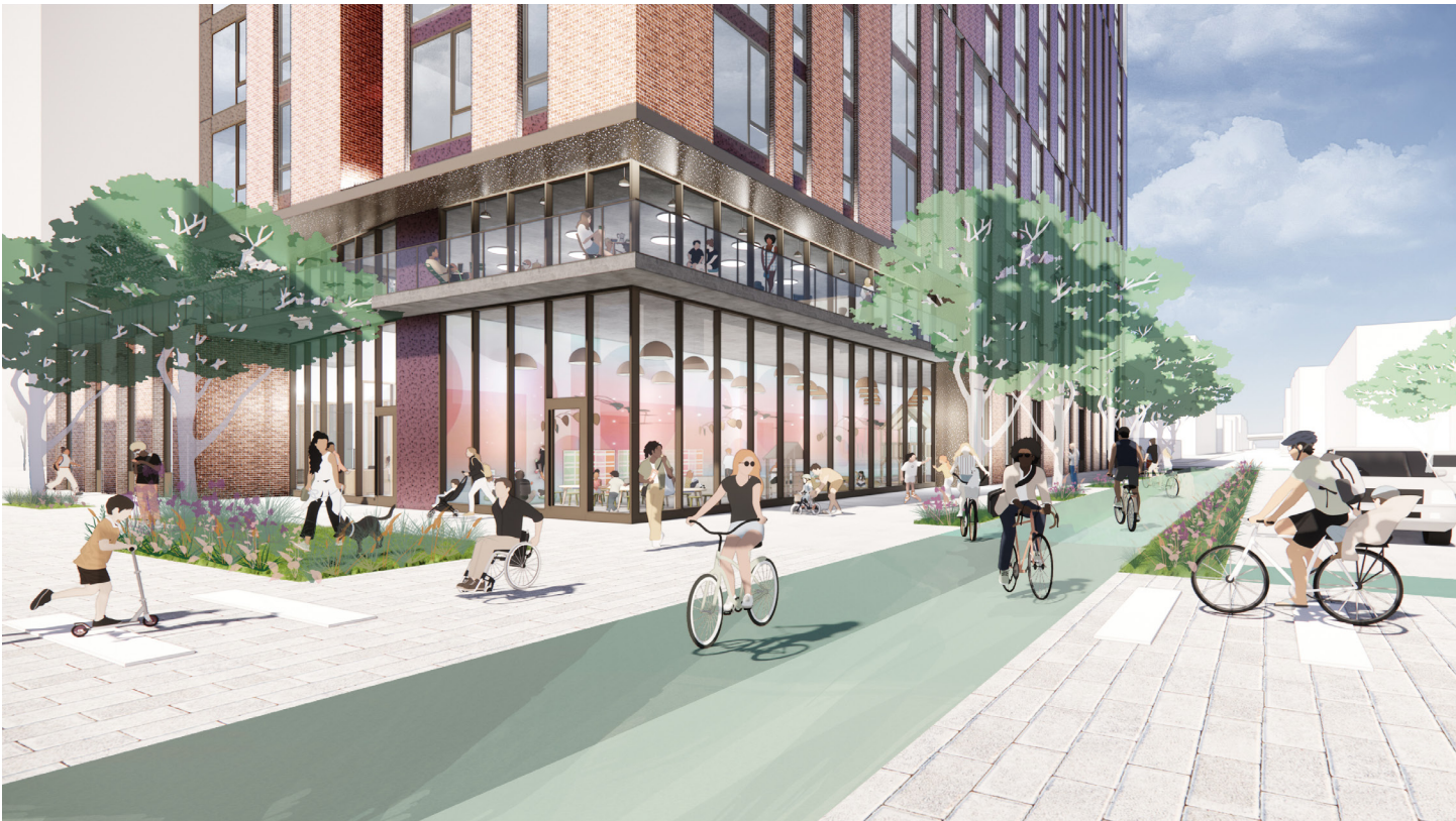
2. View from NW Park & NW Johnson Looking Southwest