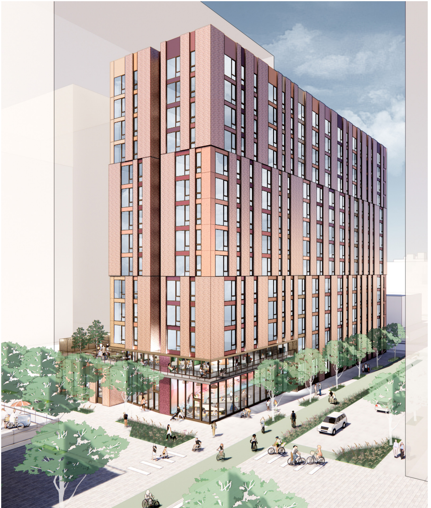
1. View Looking Southwest

Home Forward | Urban League | HOLST | COLAS