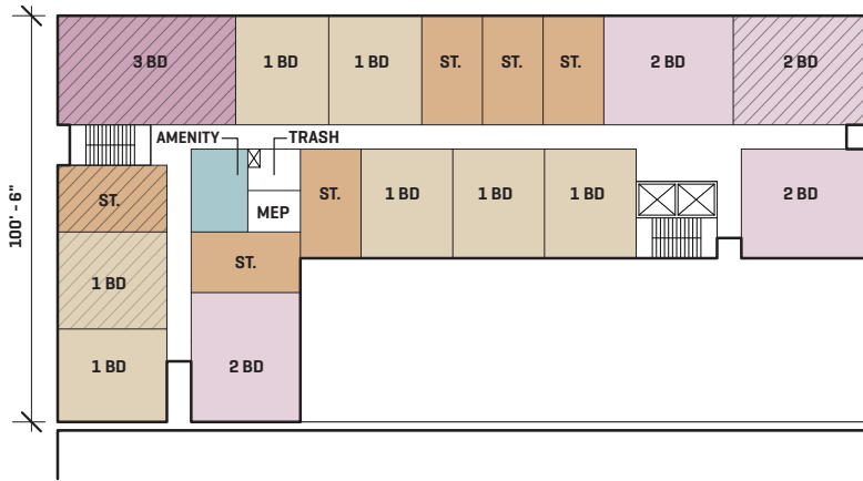
LEVEL 3-14 FLOOR PLAN